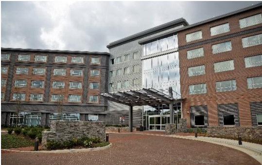
The Stateview Hotel, will be the 2019 Conference Hotel

The College of Engineering at NC State University is ranked a top-25 research and teaching institution in the country. Engineering degrees are offered through nine academic departments in the college and three departments in other colleges. The College offers 18 bachelor's, 21 master's, and 13 doctoral degree programs and 16 online engineering master's degrees. Annual enrollment in Engineering exceeds 10,000 students including more than 6,000 undergraduates and more than 3,000 graduate students.