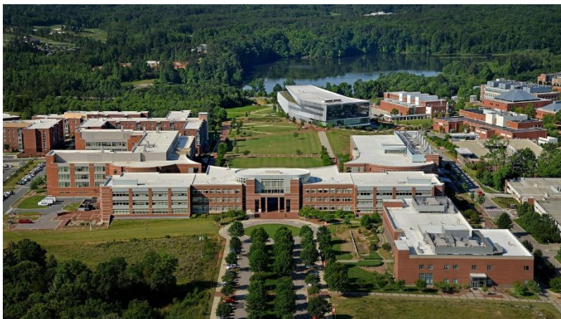
North Carolina State’s Centennial Campus