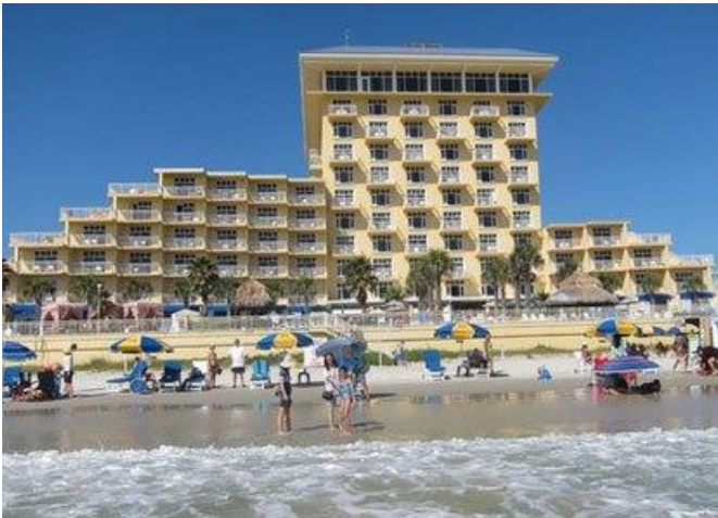
The Shores Spa & Resort at Daytona Beach: Site of 2018 ASEE SE Conference