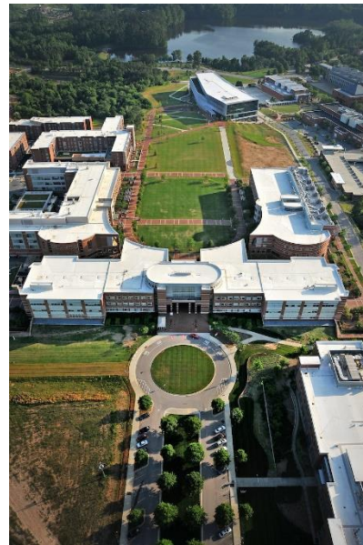
Aerial View of North Carolina State's Centennial Campus

Visit http://go.ncsu.edu/asee-se for more information including the call for papers/workshops/posters and the link for registration at the Stateview Hotel and the conference rate.