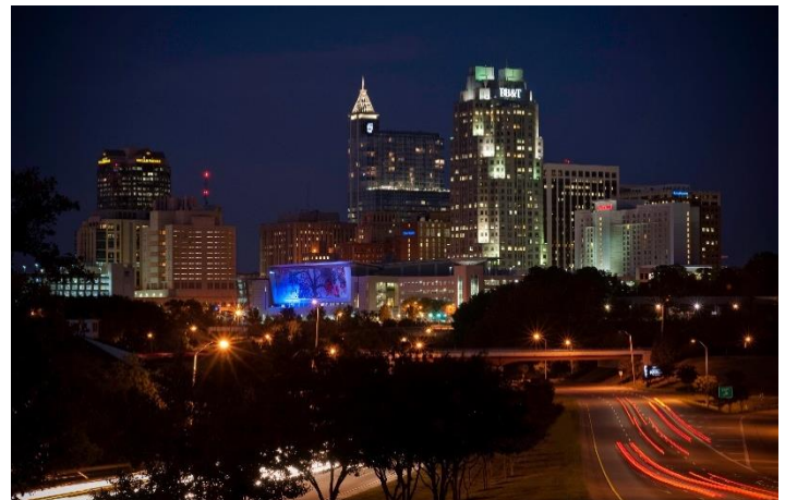
Downtown Raleigh skyline at night