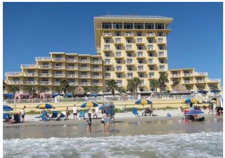
Shores Resort & Spa at Daytona Beach