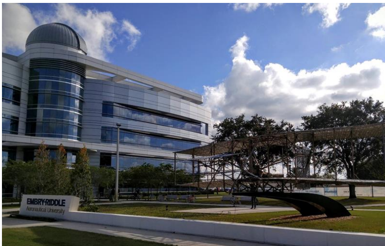
Embry-Riddle Aeronautical University (ERAU) at Daytona Beach