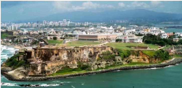
San Juan, PR: Site of 2017 ASEE Zone 2 Conference