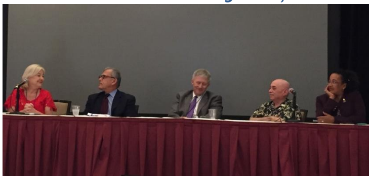
Special Zone 2 Conference session with Engineering Society Presidents on “Engineering Everywhere for Everyone”