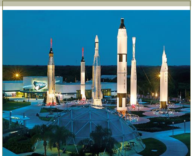
The nearby Kennedy Space Center Visitor Complex

Our host ERAU was founded in 1926, just 23 years after the Wright Brothers’ historic flight. After 90 years, it has become the world’s largest, fully accredited university specializing in aviation and