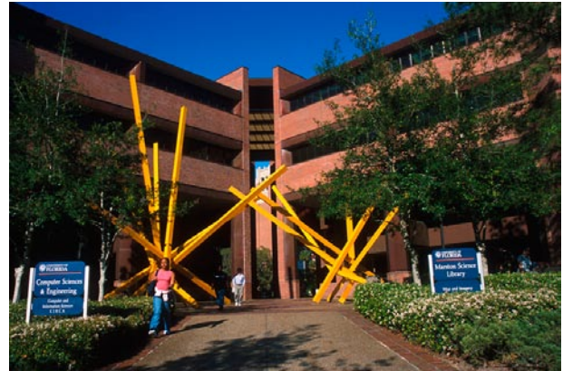
Marston Science Library

hensive university. In 1853, the state-funded East Florida Seminary took over the Kingsbury Academy in Ocala. The seminary moved to Gainesville in the 1860s and later was consolidated