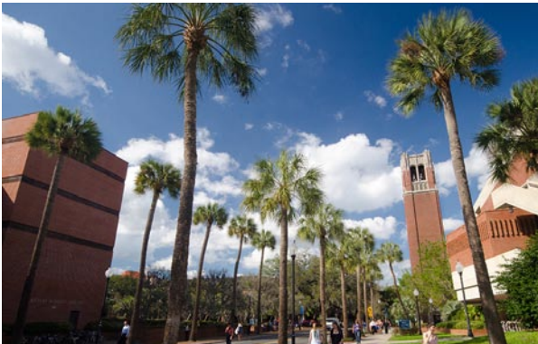
University of Florida Campus Scene

Across the street from the hotel within easy walking distance is the Harn Museum of Art which features paintings by Monet, the Butterfly Rainforest, and the Florida Museum of Natural